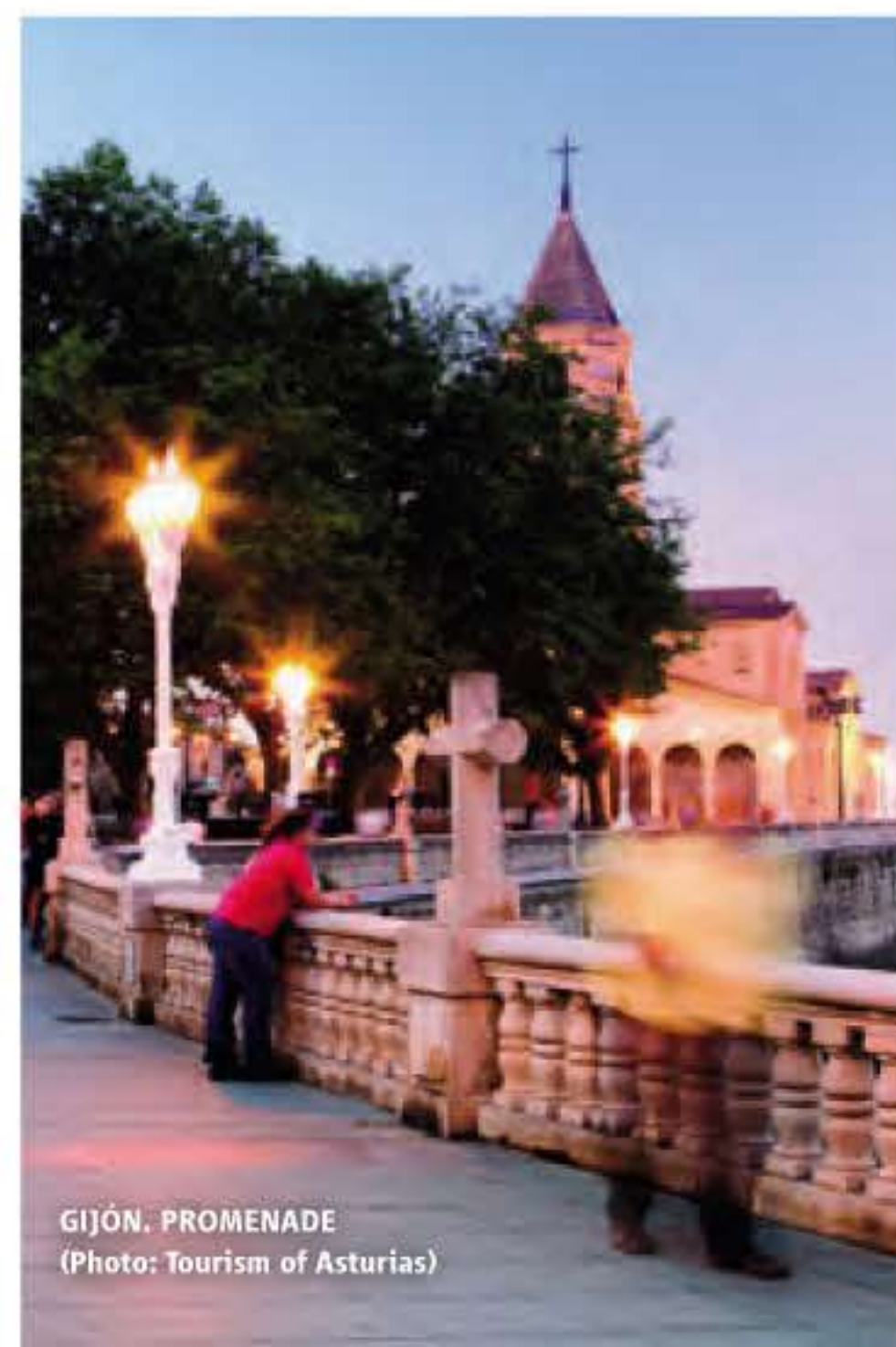
GIJÓN. PROMENADE