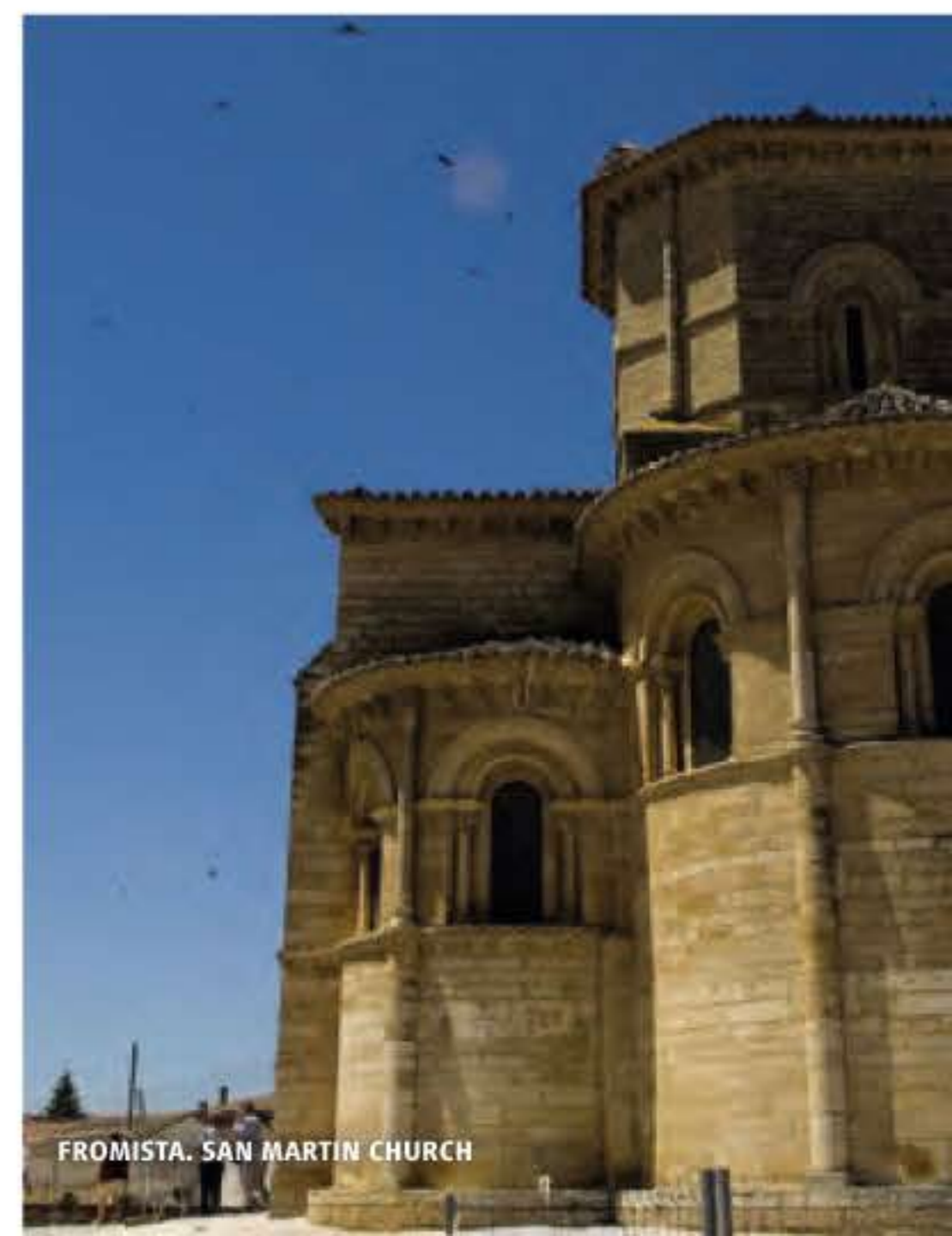
FROMISTA. SAN MARTIN CHURCH